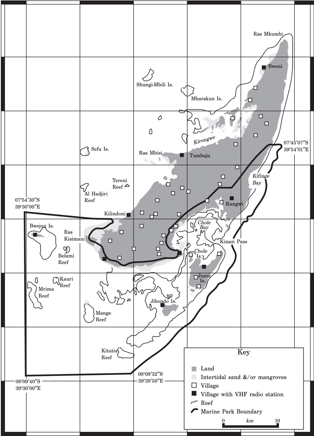
Figure 2: Mafia Island Marine Park

The second activity was addressed by a workshop, funded by the World Wide Fund for Nature (WWF), which was held on Mafia from 20 to 25 October 1991. As a result of the workshop a proposal for the development of the MIMP was recommended. This provided a basis for the preparation of a General Management Plan (GMP). This workshop is often considered the centrepiece of community participation. The draft General Management Plan developed post-workshop (completed 1993) includes development proposals, zoning plans and administrative arrangements. The GMP was prescriptive and ambitious and despite claims about community participation, has never been circulated to stakeholders.